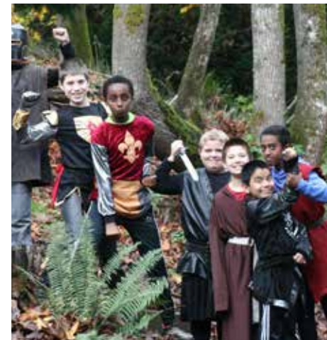
Fifth grade boys flex some medieval muscle on Reformation Day.