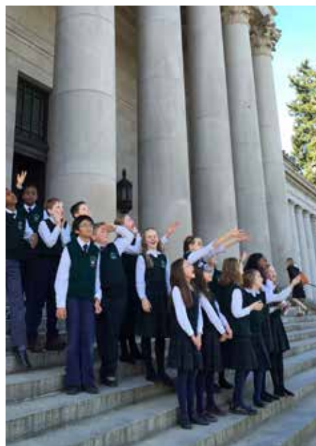
Left: Fifth grade students visit the state capital.