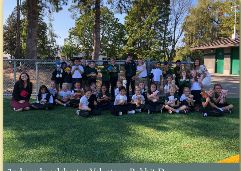
2nd grade celebrates Velveteen Rabbit Day.