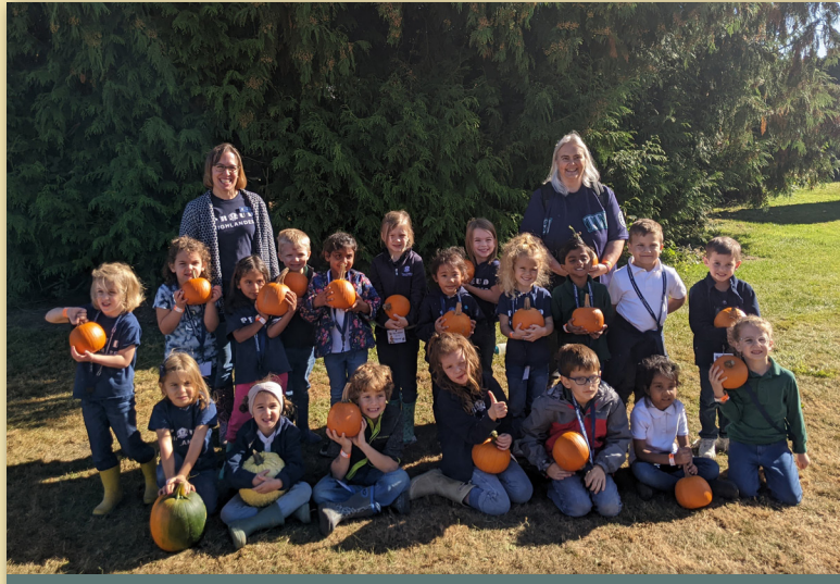
Kindergarteners pick pumpkins at Swans Trail Farm.