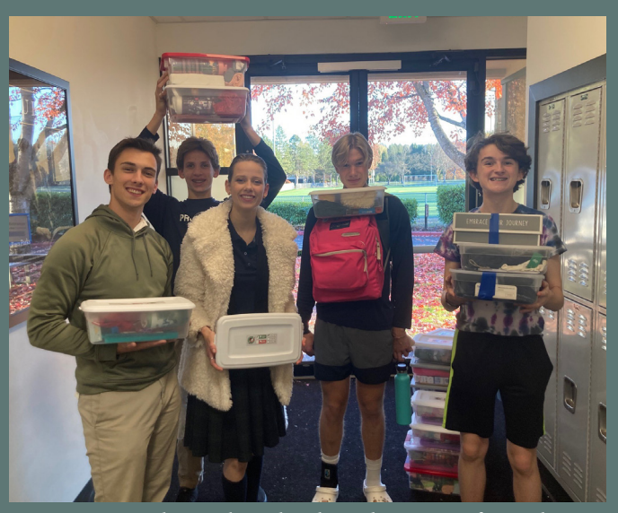
House Council members load up donations from the secondary Operation Christmas Child event.