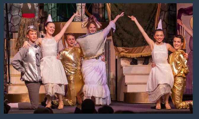
High School Drama: The Sound of Music

The annual benefit dinner and auction, happening March 18, is coming up! Items range from physical items to vacations. The auction is an excellent way to meet and get to know other families as well as supporting the school by bidding on assorted items or experiences, so we encourage everyone to come.