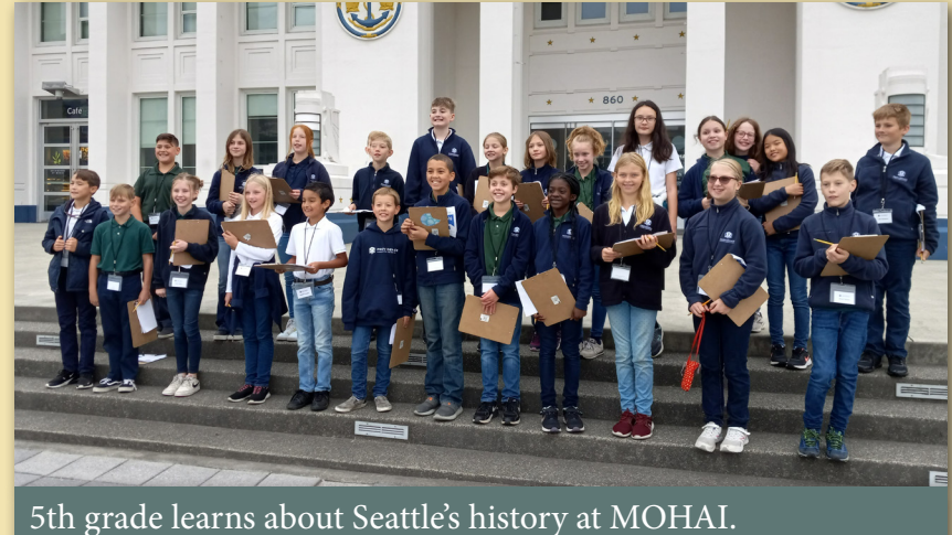
5th grade learns about Seattles history at MOHAI.