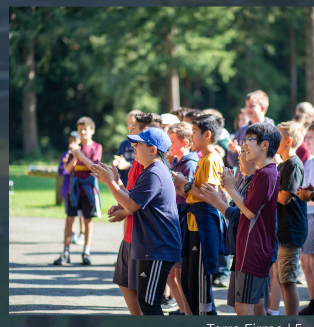
Terra Firma | 5