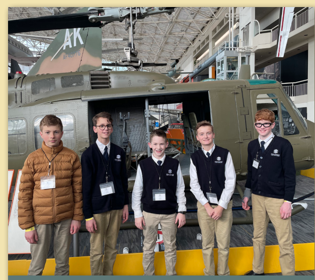
6th grade boys at their field trip to the Museum of Flight.