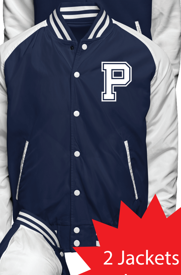
Weather Proof Nylon Side